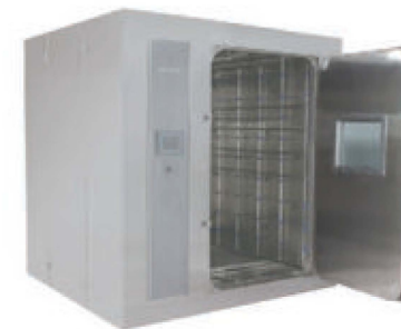
BWS-C-S Cage & Rack Washer